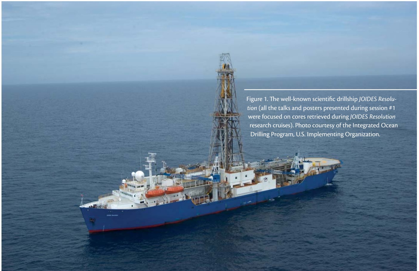
Figure 1. The well-known scientific drillship JOIDES Resolution (all the talks and posters presented during session #1 were focused on cores retrieved during JOIDES Resolution research cruises).

tests despite diagenetic concerns associated with older, typically more deeply buried sequences. It was shown, for example, that thermal maxima events that occurred during the Eocene were marked by rapid warmings and by major carbon-cycle perturbations. Although the warmings at these events were not as dramatic as those associated with the Paleocene/Eocene Thermal Maximum, these events may have had similar triggers. To better understand the global carbon cycle, alkenone-based carbon isotope records were used to reconstruct atmospheric carbon dioxide levels dating back to the middle Eocene. This work