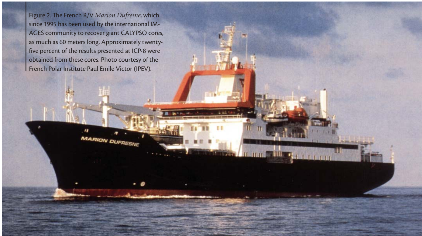
Figure 2. The French R/V Marion Dufresne , which since 1995 has been used by the international IMAGES community to recover giant CALYPSO cores, as much as 60 meters long. Approximately twenty-five percent of the results presented at ICP-8 were obtained from these cores.

ity Holocene marine records from the North Atlantic were presented. An increasing emphasis on high deposition rate and, in some cases, laminated (Figure 3) sediment sequences has allowed many of these records to be sampled at subcentennial, and even subdecadal, time resolution. For example, results showing a close link between the strength of the Hadley circulation and the northward extent of the Intertropical Convergence Zone during the pronounced Holocene climate events demonstrated the importance of exploring the seasonal character of the proxies used. In the Pacific Ocean, ^{18}\text{O} results from more than a dozen fossil corals from Palmyra Island together preserve a record of interannual to centennial-scale tropical Pacific climate vari-