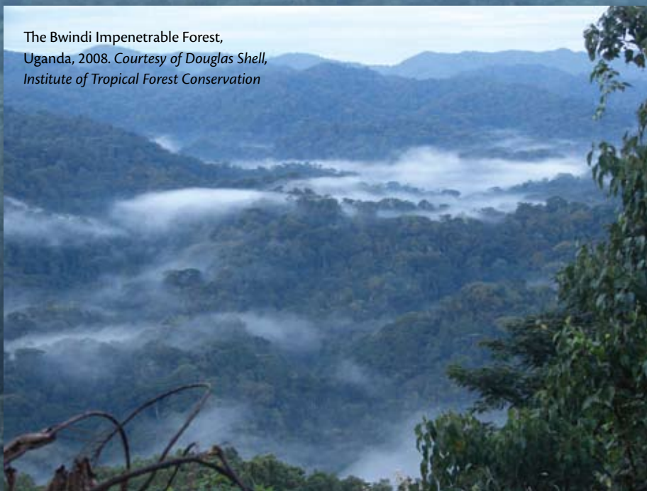
The Bwindi Impenetrable Forest, Uganda, 2008.

What they may have missed is what’s being termed an atmospheric moisture pump. With this pump at work, “the numbers add up,” says Sheil. “Condensation thus offers a mechanism to explain why continental precipitation doesn’t invariably