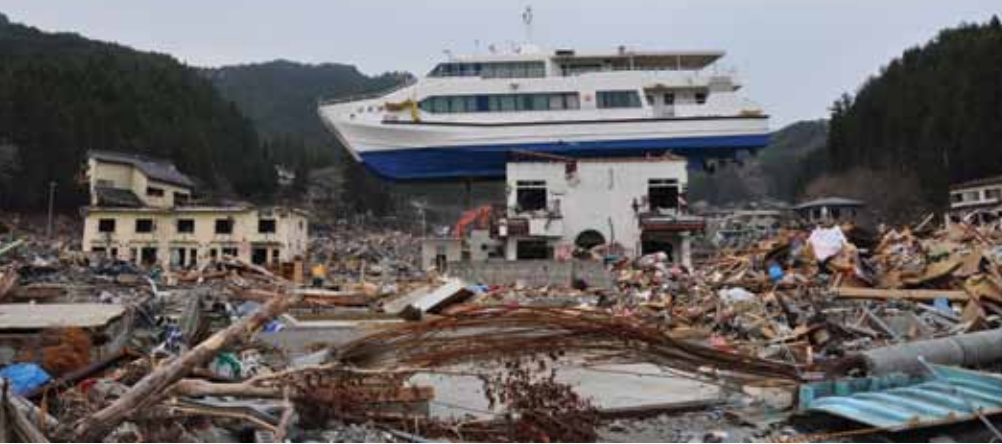
Boat stranded in Otsuchi, Japan, during the March 2011 tsunami.

cooperative relationship so that scientists are working with, and not against, the government as it assesses impact and responds to the needs of its people. In each ITST, UNESCO-IOC and ITIC work with government agencies and regional partners to facilitate smooth-running surveys endorsed by the country, especially if access is provided; in return, it is expected that scientists will share their preliminary findings, preferably before they leave.