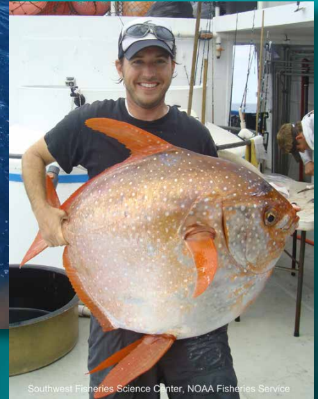
Southwest Fisheries Science Center, NOAA Fisheries Service